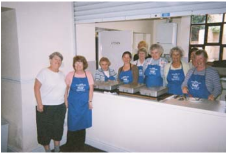
Lunch club volunteers in Pill